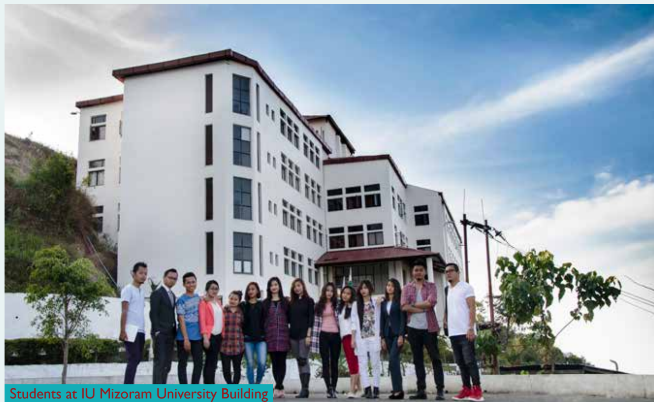
Students at IU Mizoram University Building