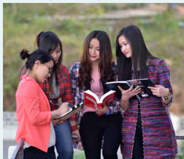
UG Students discussing their lessons