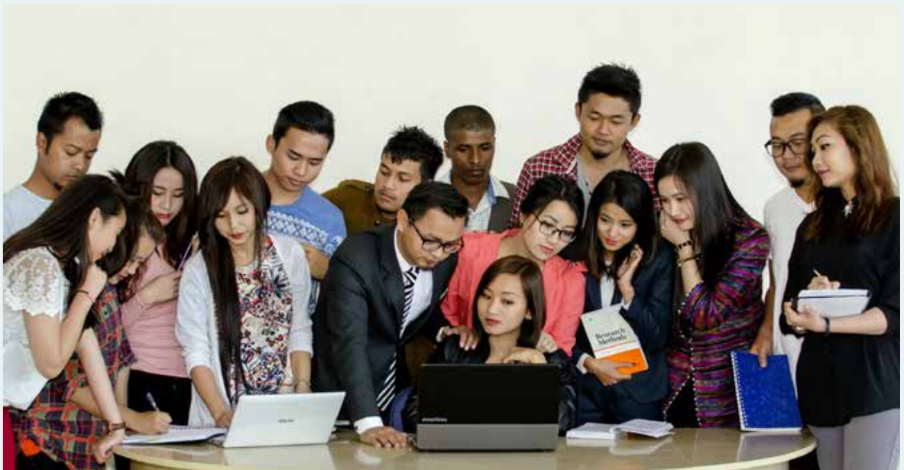
ICFAI Students preparing for their presentation