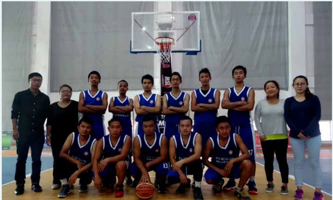
The University Basketball Team at the Mizoram Invervarisity Basketball Tournament

Farewell function for the outgoing students was held on 29 th April, 2016 at University Auditorium. The annual event organized is part of the University's internal marketing events.