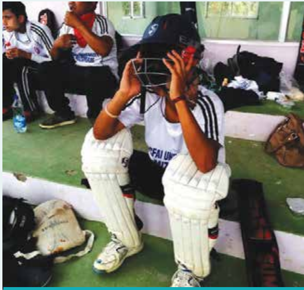
ICFAI Team member at the Intervarsity Cricket Tournament

The team from Providence HSS Aizawl were declared the champion's for 2016 defeating St. Josephs HSS in the finals. The event was telecast live across the state.