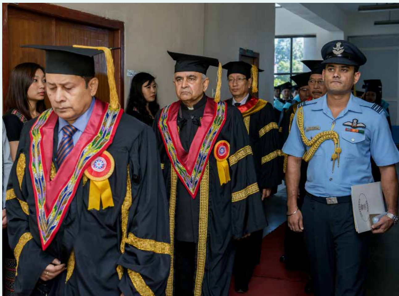
4 th Convocation Procession

Term-End-Examinations: These are conducted twice a year in March-April and September-October. The weightage is 70%.