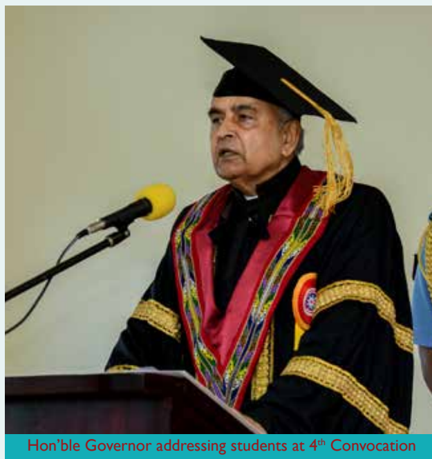
Hon'ble Governor addressing students at 4 th Convocation