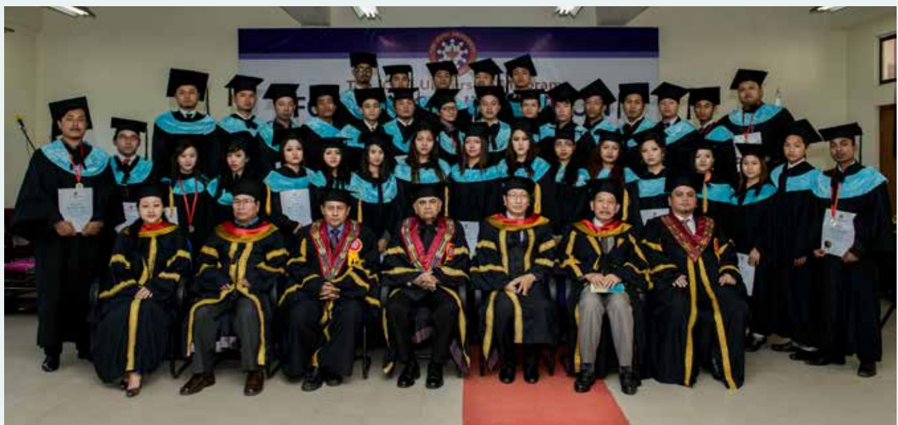
Governor of Mizoram, Board Members & Officers of the University with Graduating Students 2015

The ICAI University, Mizoram is a professionally managed University. All the statutory bodies are constituted in accordance with the Act, Statutes and Rules of the University. They meet regularly to review the operations of the University. Issues pertaining to institutional development, long-term strategies, programs to be developed, human resources, staff recruitment, training and development and financial matters are discussed at these meetings. Appropriate decisions are taken and guidelines given for their implementation with the objective of achieving academic excellence.