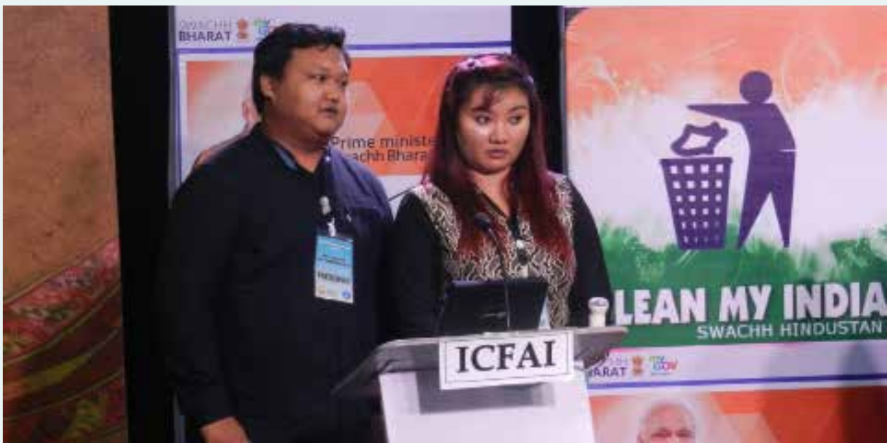
ICFAI team at Intervarsity College Quiz Competition

The University sponsored the "ICFAI LPS Inter Higher Secondary School Quiz Competition – 2016" in partnership with at LPS Vision studio the largest cable network in Mizoram. The annual competition was telecast live from April 12, 2016 till April 29, 2016.