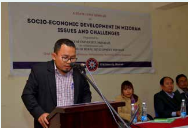
The First State Level Seminar Organized by ICFAI in collaboration with SIRD, Mizoram