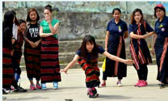
Inkawibah (Female Sport) at Annual Sports 2016

As part of its community Outreach over 140 school children from various local schools were invited to the University Campus. The children and their teachers interacted with staff and faculty members. The students toured the campus and viewed the University facilities