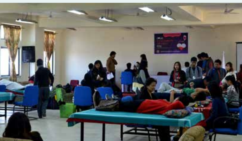
Blood Donation Camp at University Auditorium