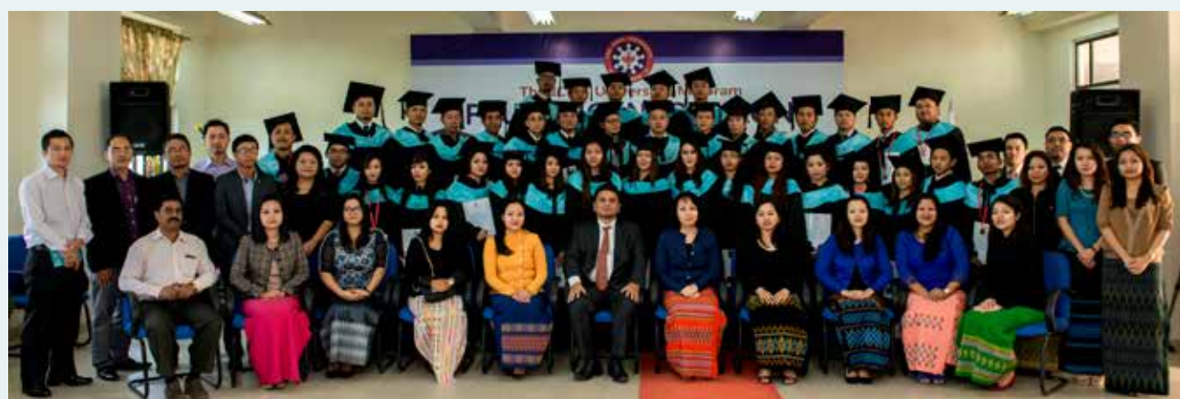
Faculty with Graduating Students