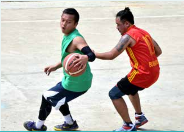
Students playing Basket Ball

A Geography Laboratory has been established to undertake such activities as cartography, GIS and soil testing etc.