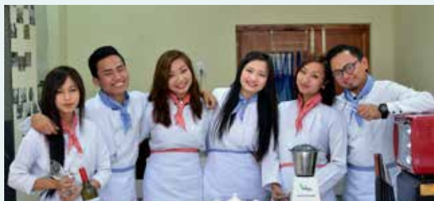
BHM Students at the Food Production Lab

In recognition of the importance of practical experience in the Hospitality field, the University has set up practical labs for food production, housekeeping and front office training. The facilities are designed to give the students the hands on experience that will give them an edge in the job market.