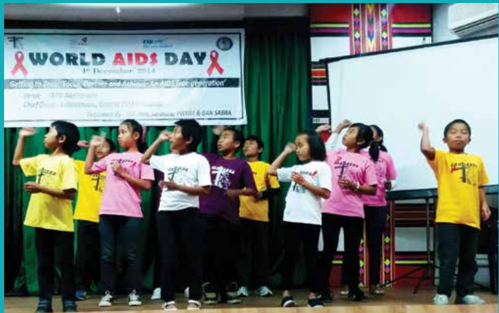
AIDS affected children from the Gan Sabra Home perform on World AIDS Day

Vice Chancellor and Registrar and various staff and faculty members participated in the visit.