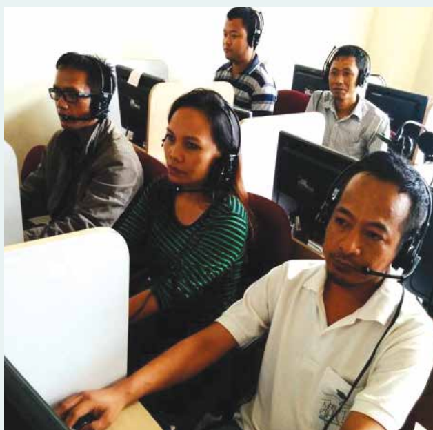
English Language Laboratory

The English Language Lab consists of dedicated hardware and software designed for language training. The lab has 20 student terminals and one instructor's terminal with voice input and output equipment.