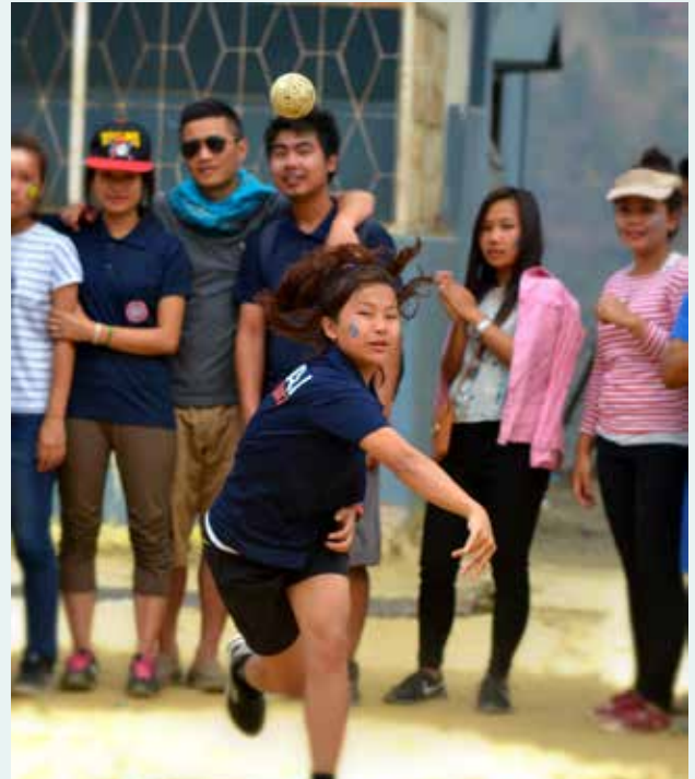
Women Shotput Competition at Annual Sports 2016

Regional Institute of Paramedical and Nursing Sciences (RIPANS) were declared champions, defeating IGNOU Mizoram in the finals. The event was covered in the local print and televised media.