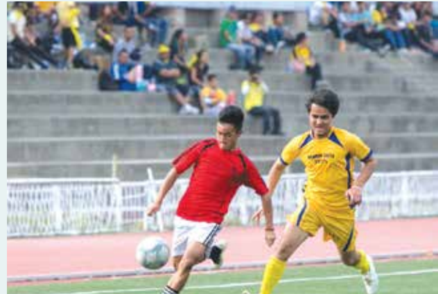
ICFAI Students at the Intercollege Football Tournament

The ICFAI University Mizoram football team was invited to participate in the 'MSU Cup 2016' a annual inter-college football tournament organized by the Mizo Students' Union (MSU). All major institutions in Mizoram participate in the MSU tournament and the event is telecast and covered in local print and electronic media.