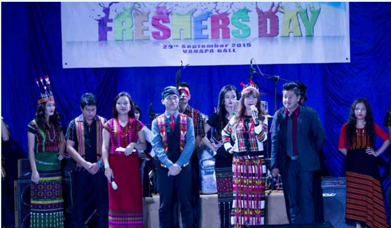
Students at Freshers Day Celebrations

Due to the high rainfall and humidity in Mizoram, the exterior paint of the University building has been worn and severely discolored. This year major repainting and repair work was completed.