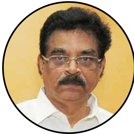
His Excellency Dr. Hari Babu Kambhampati Hon'ble Governor of State of Mizoram