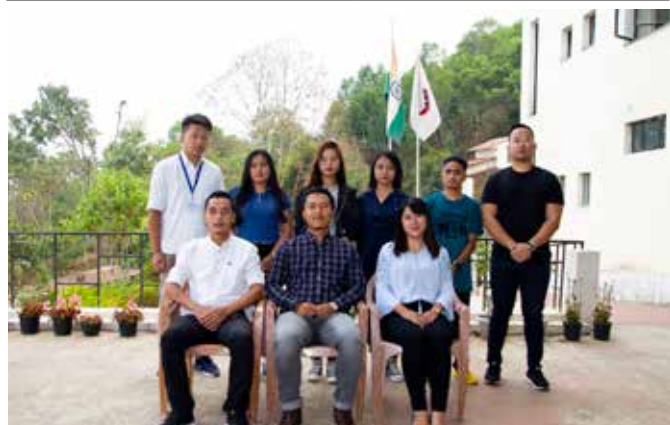
Placement Drive @ Grand Hotel